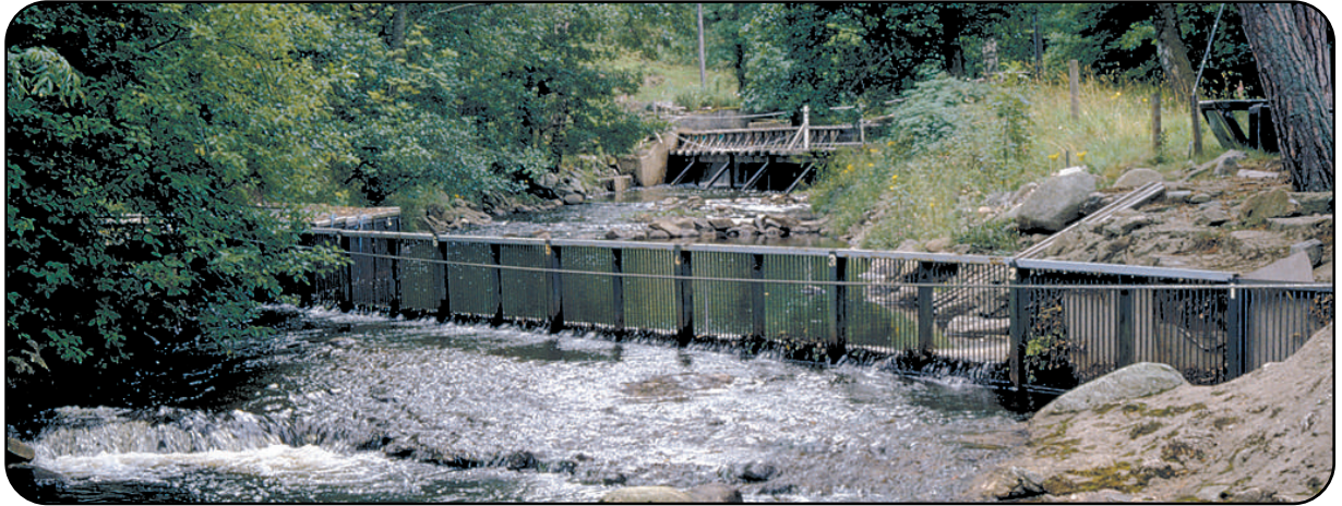
Figure 1. The Girnock traps. The fence in the foreground guides adult fish into the adult trap on the left. The smolt trap can be seen in the background.